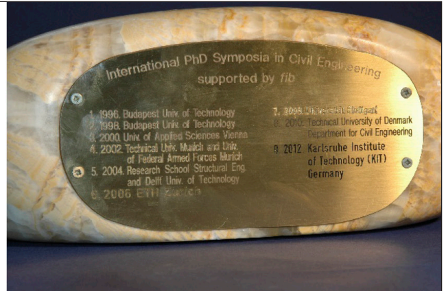
Back plate at the Symbolic stone to include the names of organizing universities