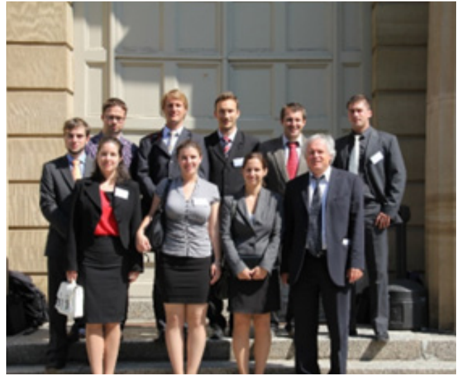
Fig. 5: Participants from BME, Hungary, at the PhD Symposium 2012 KIT Karlsruhe, Germany