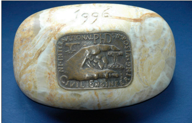
Bronze relief at the front of the Symbolic stone