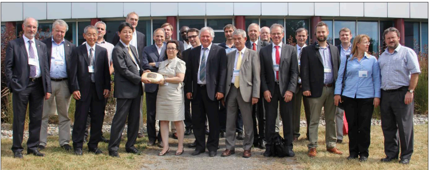
Fig. 4.c: The Scientific Committee of Professors for PhD Symp 2014 Quebec City and delivery of the Symbolic Stone for PhD Symp 2016 Tokyo

Discussions are essential parts of these Symposia. This