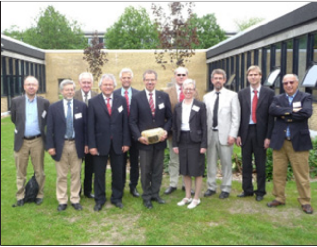
Fig. 4.a: The Scientific Committee of Professors for the Technical University of Denmark, Lungby (2010) and delivery of the Symbolic Stone to the Karlsruhe Institute of Technology (2012)