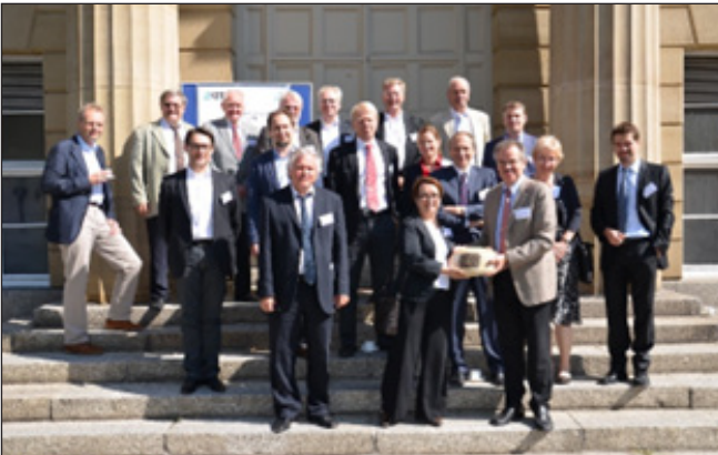
Fig. 4.b: The Scientific Committee of Professors for the Karlsruhe Institute of Technology (2012) and delivery of the Symbolic Stone to the Université Laval, Quebec City (2014)